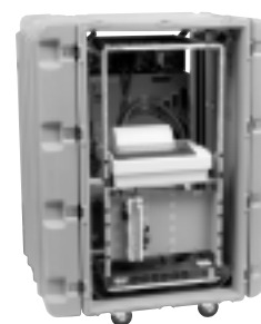
Printer mounts in back

Should the user desire, portable CTI operation may be easily added to the consoles by installing Zetron's Integrator 9-1-1 software on Windows 2000 laptops. A PC network is not required which keeps the deployment simple.