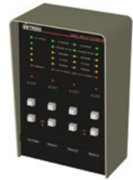
Model 6203 IP Station Unit

The Model 6204 is an expansion that can be used to support four apparatus in addition to the three supported by the Model 6203. Multiple Model 6204 IP Station Units can be added to the system. With each addition of a Model 6204, four more apparatus can be added to a fire station.